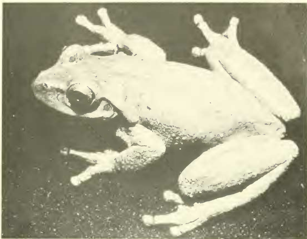
Fig. 4. Paratype of Hyla pelidna , KU 181108, male, 33.5 mm SVL.

width of eyelid; supratympanic fold moderately heavy, curved from eye to point above insertion of forelimb, obscuring upper part of tympanum; tympanic annulus distinct; tympanum separated from eye by distance nearly twice diameter of tympanum; diameter of tympanum about half diameter of eye.